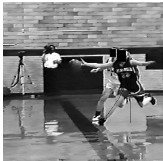
Figure 1 Still image of a female anterior cruciate ligament (ACL)-injured subject during injury (front player, no. 22) relative to a control player (behind her), demonstrating the association between lateral trunk motion and medial knee collapse in the injured subject, but not the control player (obscured view, not analysed). This is frame 1 (initial foot contact with ground) of the subject (no. 22) landing and shows the calculated angles and the combined lateral trunk motion and knee abduction.

All angle measurements were imported into Statview V 5.01 (SAS Institute, Cary, North Carolina, USA) for statistical analysis. Repeated measures analysis of variance (ANOVA) with Fisher protected least significant difference (PLSD) post hoc tests were performed to assess if there were statistically significant differences between female subjects and controls, and male and female ACL-injured subjects. Significance was set at p \leq 0.05 . Intraclass coefficients (ICCs) were calculated to assess the reproducibility of the angle measurements at each video frame sequence at three different times. The single rater repeated the measured videotape frames of 4 angles in a total of 10 subjects (2 angles/6 subjects; 2 angles/4 subjects). The estimated ICCs ranged from 0.52–0.99, with 18 of the 20 coefficients greater than 0.95. 22