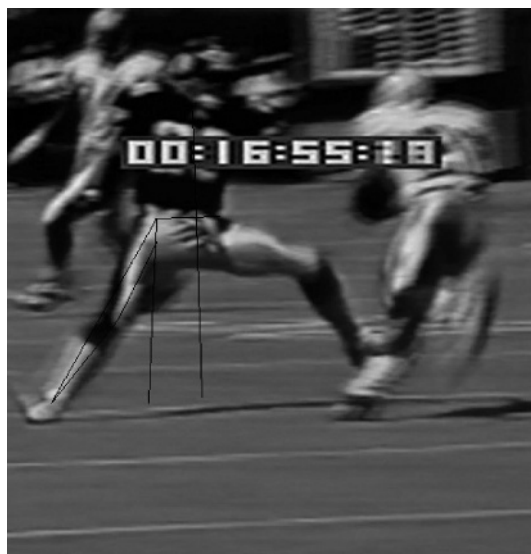
Figure 2 Still image with coronal angles a male subject demonstrating the absence of an association between lateral trunk motion and medial knee collapse during anterior cruciate ligament (ACL) injury.

Female ACL-injured subjects demonstrated significantly increased knee abduction during landing compared to male ACL-injured subjects and showed a trend toward more knee abduction than female controls ( p \leq 0.05 ; fig 4). After initial contact, the knee abduction moment remained relatively unchanged in the controls, but the female ACL-injured subjects showed progressively more knee abduction with each consecutive sequence (fig 4). The mean differences between subjects and controls for the third through fifth frames were significant ( p \leq 0.05 ). No significant differences were observed in knee flexion angle between subjects and controls across the five repeated measure frames. There were no significant differences observed in knee flexion between either female and male ACL-injured subjects or between female ACL-injured subjects and female controls. 22